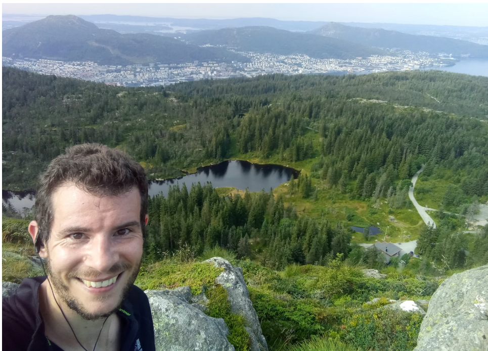
Above: Running in the Bergen mountains.